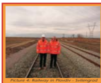
Picture 4: Railway in Plovdiv - Svilengrad