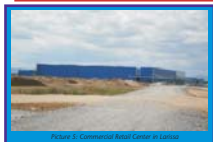
Picture 5: Commercial Retail Center in Larissa